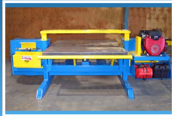
24hp Gas Band Saw Dismantler