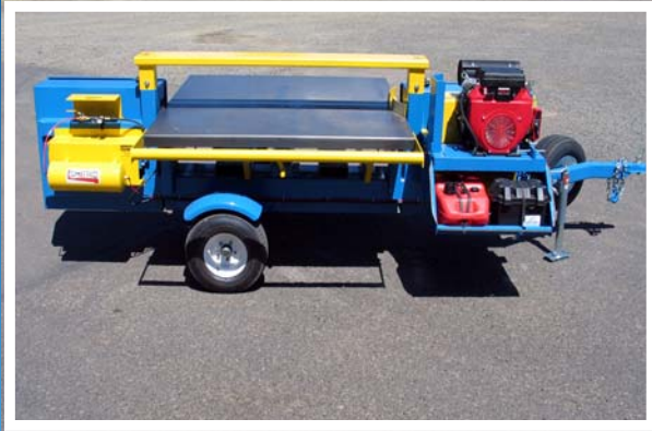
Portable Band Saw Dismantler