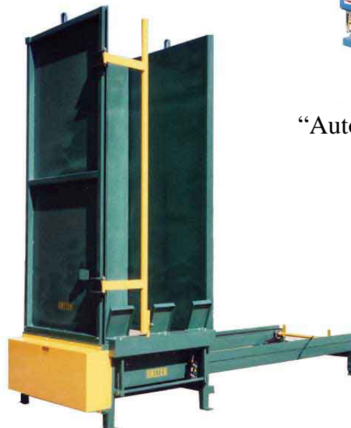
Forklift Load Dispenser