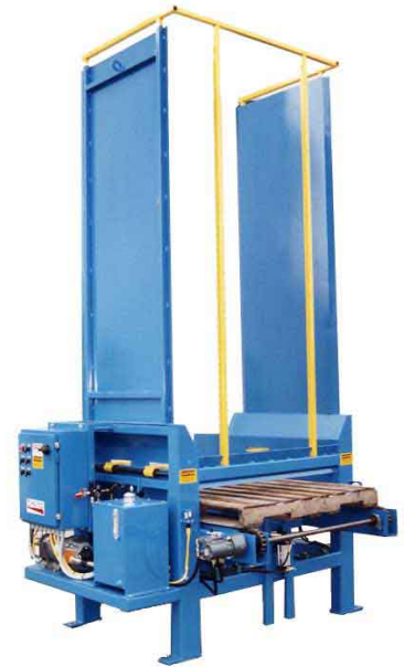
“Auto-Infeed” Inline Dispenser